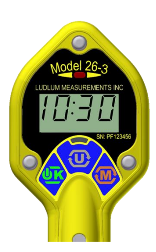
Figure 7: COUNT mode operation showing COUNT Timer of 10 minutes, 30 seconds.

Ludlum Measurements, Inc. Page 2-11 November 2023