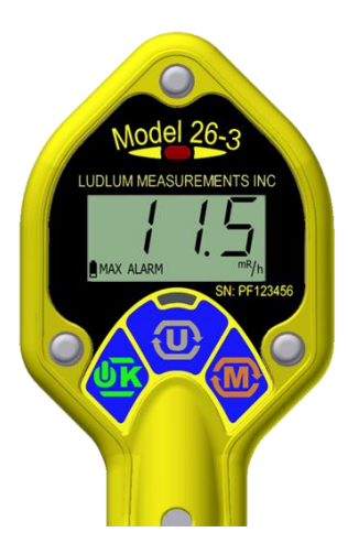
Figure 6: MAX mode operation display with ALARM indicator and alarm LED.

Ludlum Measurements, Inc. Page 2-8 November 2023