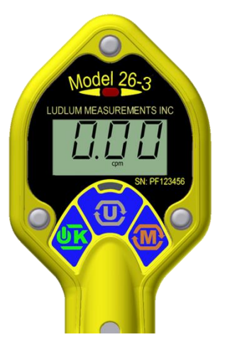
Figure 3: Detector Failure display (shown for cpm); will also flash.