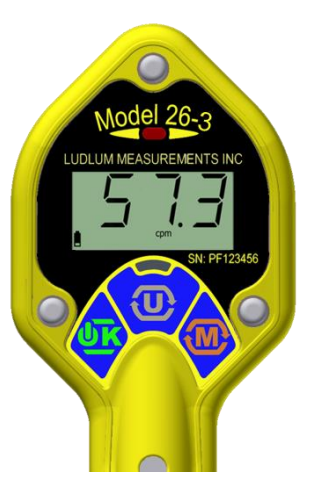
Figure 5: RATE mode display showing typical background radiation rate and the low-battery icon.

Ludlum Measurements, Inc. Page 2-7 November 2023