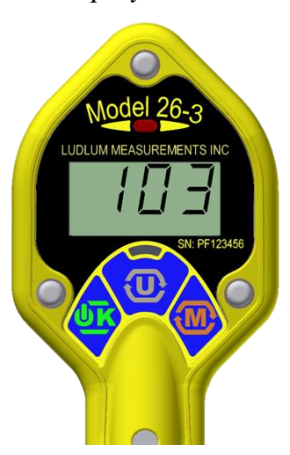
Figure 2: Firmware version display and Alarm LED check shown.

The instrument will then move to normal operation, displaying the current rate for the Primary units (default: cpm).