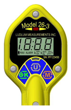
Figure 1: Startup display for Model 26-3, with all LCD segments shown.

The instrument then displays the firmware version number and activates the Alarm LED briefly. Should the Alarm LED fail to turn on, the device is in need of repair. Please refer to Figure 2 below.