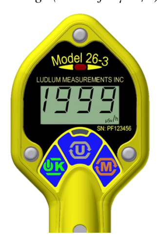
Figure 4: Detector Over Range (shown for \mu Sv/h ); will also flash.

Ludlum Measurements, Inc. Page 2-5 November 2023