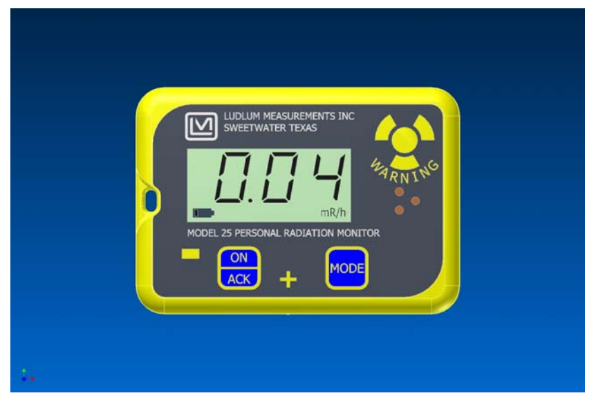
Figure 1: The Exposure Rate Screen shows typical background radiation rate and the lowbattery icon.

Zeroing Accumulated Dose: In order to "zero" the accumulated dose, the user must enter the setup mode, and then not press any other buttons. The parameters will change every four seconds, and the unit will return automatically to the normal mode after the last parameter is presented. The accumulated dose has now been reset to zero.