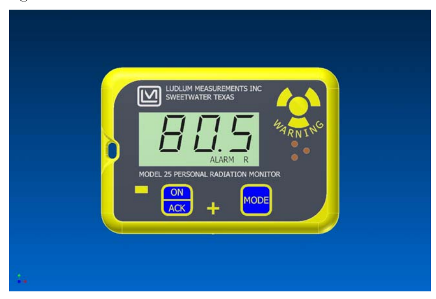
Figure 2: Accumulated Dose Screen with ALARM indicator

The Accumulated Dose screen is shown in Figure 2. 80.5 R is a significant dose, and thus Figure 2 also shows the ALARM indication.