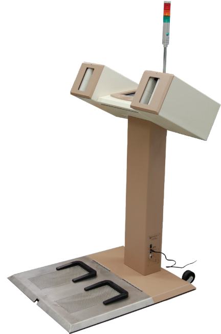
(shown with optional Status Light Tower)

All maintenance can be performed from the front of the instrument. Detector access for quick replacement or repair is facilitated by hinged top covers. The unit is equipped with rear-mounted wheels to facilitate transporting the instrument from one location to the next.