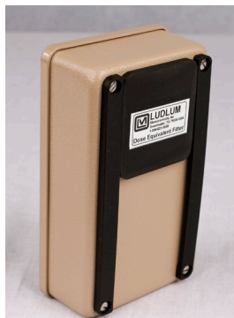
Sliding Dose Equivalent Filter shown closed (above) and open (right).

As most know, the venerable GM pancake has a significant over-response at lower energies between approximately 20 to 160 keV. Any exposure or dose measurements taken with an unfiltered GM pancake detector would thus have unacceptable errors at these lower energies. To counteract this tendency, Ludlum Measurements developed a sliding filter for the Model 2401-P GM pancake detector that flattens the response to within 20% referenced to 137 Cs (662 keV) over an energy range of 20 keV to 1.2 MeV.