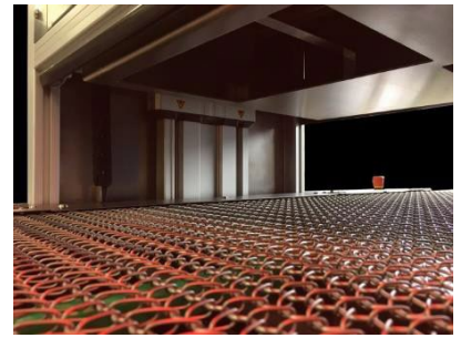
Detector height adjustment